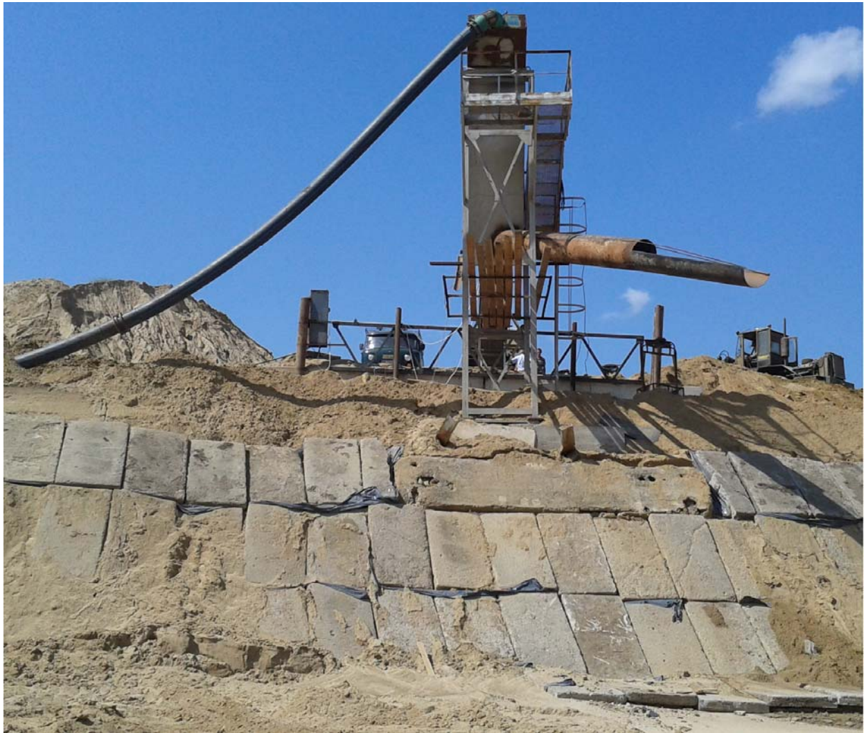
Fig. 2. Complex for granular materials washing MPG-1600 on the industrial site of the quarry East-Bugskiy-2 deposits of sand